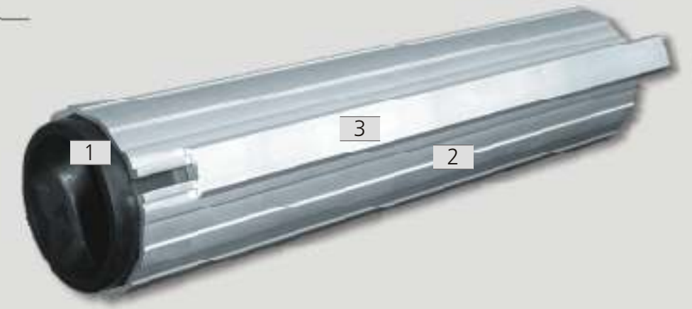
2 Stator Tube